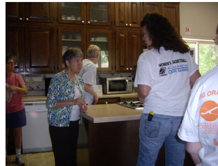
A busy time in the Riverwood kitchen.

Often a person is described as having a servant's heart. The distinction is made as though it is a rare quality. Really, any person whose heart has been changed by the love of Jesus should be a faithful servant. These servants are mandated by their Master to make the Gospel available to everyone.